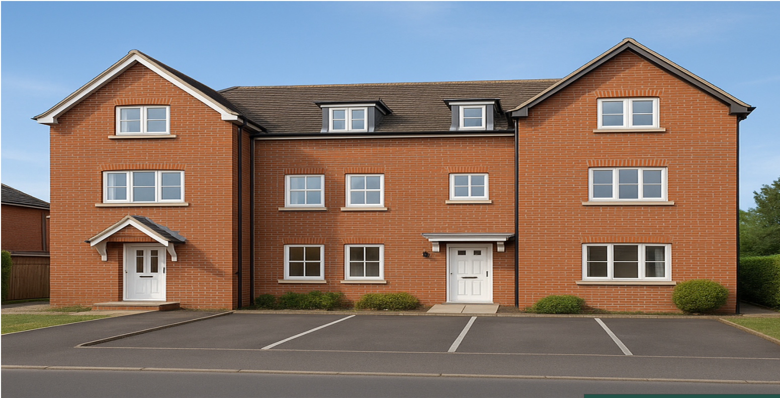
Oxford Road, Tilehurst: a block of 5 fats plus a 4 (House in Multiple Occ.